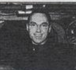
ISS004-E-5003 (December 2001) — Astronaut Carl E. Walz, Expedition Four flight engineer, is photographed in the Destiny laboratory on the International Space Station (ISS). The image was taken with a digital still camera.

In the future, ARISS hopes to fly a slow-scan television system on the International Space Station.