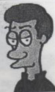
Chuckles 'Twit' Chucker