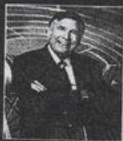
HIS VISION LIVES Gene Roddenberry 8/19/21 10/24/91

"A Kinder, Better and More Gentle World"