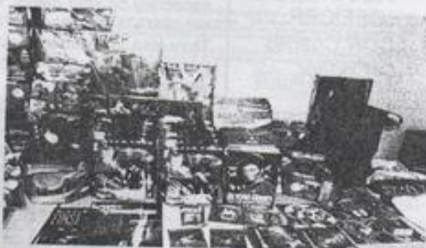
Here is a close up of some of the items that were auctioned off at the event.

We do however have lots of items left over, we determined that if it wasn't going to go for a decent price we were not going to auction it until next year. Which means we have a great start on items for next year.