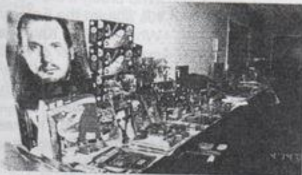
As you can see there was a lot of cool stuff that was auctioned off at our Charity Auction.

The second annual Charity Auction held by the USS Maximillian and their partner the IKB Scorpion was held on Sat April 14, 2001. Even though we had a very light turnout we managed to meet and beat last years total of $252. When all totals were calculated and we ended up bringing in (drum roll please) .....$532. WooHoo. The Scorpion took in a little over $100 and the Robert S. Lyon Memorial Scholarship took in a little over $100 and the rest will go into the ship's