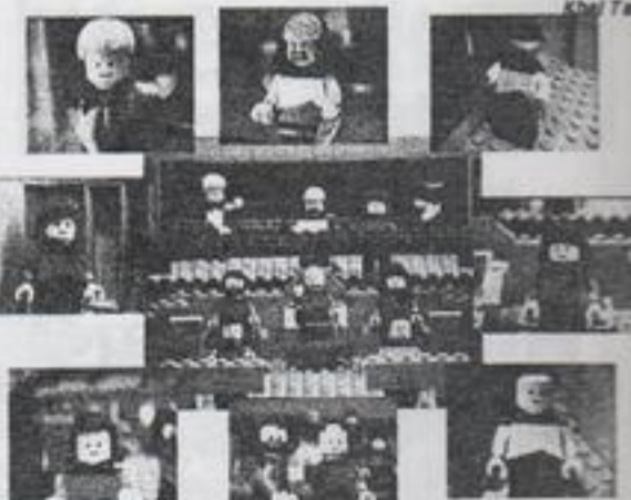
Where no U.S.S. has gone before

On September 26, 2001, at 8:00 p.m., all will be revealed, finally, to an anxious audience. Hopefully, this audience will perhaps be watching Star Trek for the first time. After all, Enterprise is set before the Original Series and if you're going to start somewhere, you might as well start at the beginning.